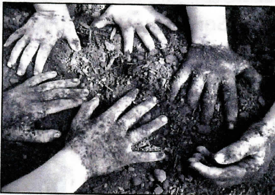
Children are at risk of lead exposure from unintentional ingestion of soil through normal play activities.

Ingesting the soil is the primary source of exposure to lead in soil. Lead can also be inhaled with very fine soil particles during outdoor tasks (e.g. dust from yard work or construction work) or carried into houses as airborne dust, or on shoes, clothing, and pets where it gets on floors or other objects that residents then come in contact with.