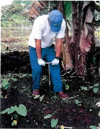
This picture shows soil sample collection from a small garden. Gardens grown near house foundations or near busy roadways have the potential for elevated soil lead concentrations.

Residential or commercial buildings that were built before 1978 or are located near busy roadways may potentially have elevated lead in soil surrounding the foundation area or in soil near the busy roadway due to former use of lead-based paint on the structures or the former use of lead-containing gasoline by vehicles. If you suspect elevated levels of lead in your soil, you may want to have the soil tested. You can hire an environmental professional to conduct testing, or call the HEER Office for advice on sampling and laboratory analysis of any samples collected.